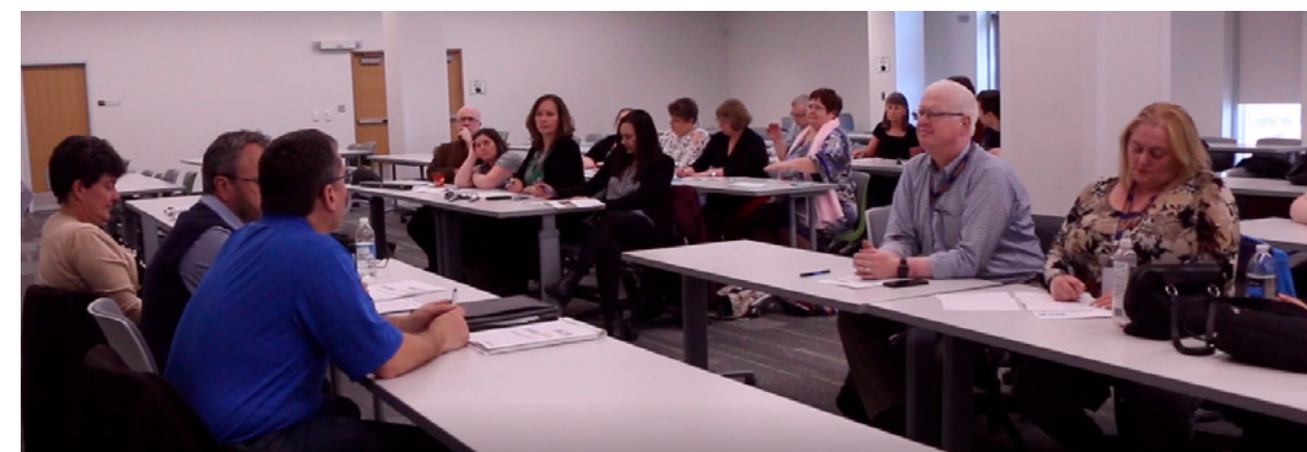
Above/below: Members of local 55 bargaining committee hold an information session for members.