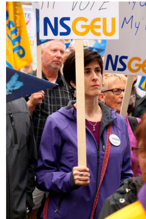
NSGEU member protest Bill 1 outside Province House.

The Labour Board decision put the IWK in position to strike, depending on the result of the strike vote. This put the employer and the government under increased pressure as they were now one step closer to facing Nova Scotia's first province-wide health care strike.