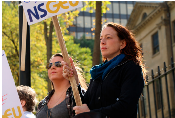
Above/below: Members protest Bill 1 outside Province House.