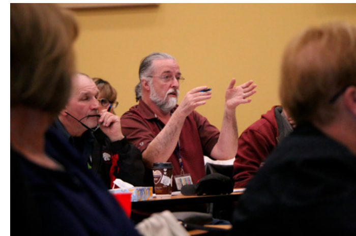
Above/below: Councils of Health Care Unions vote on May 18.

This has been a long and difficult process and we thank you for your patience and support. The finish line is in sight but there is still a lot of work to do for all four bargaining units.