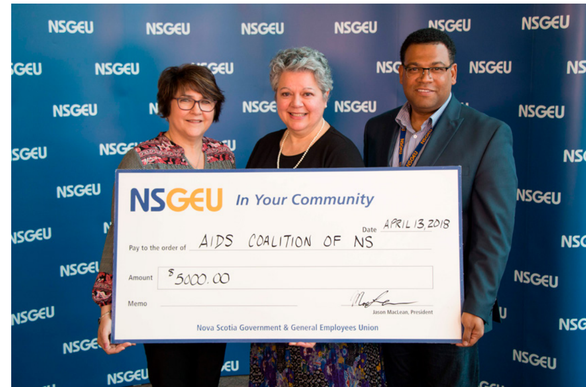
NSGEU donates in support of the Aids Coalition of Nova Scotia.