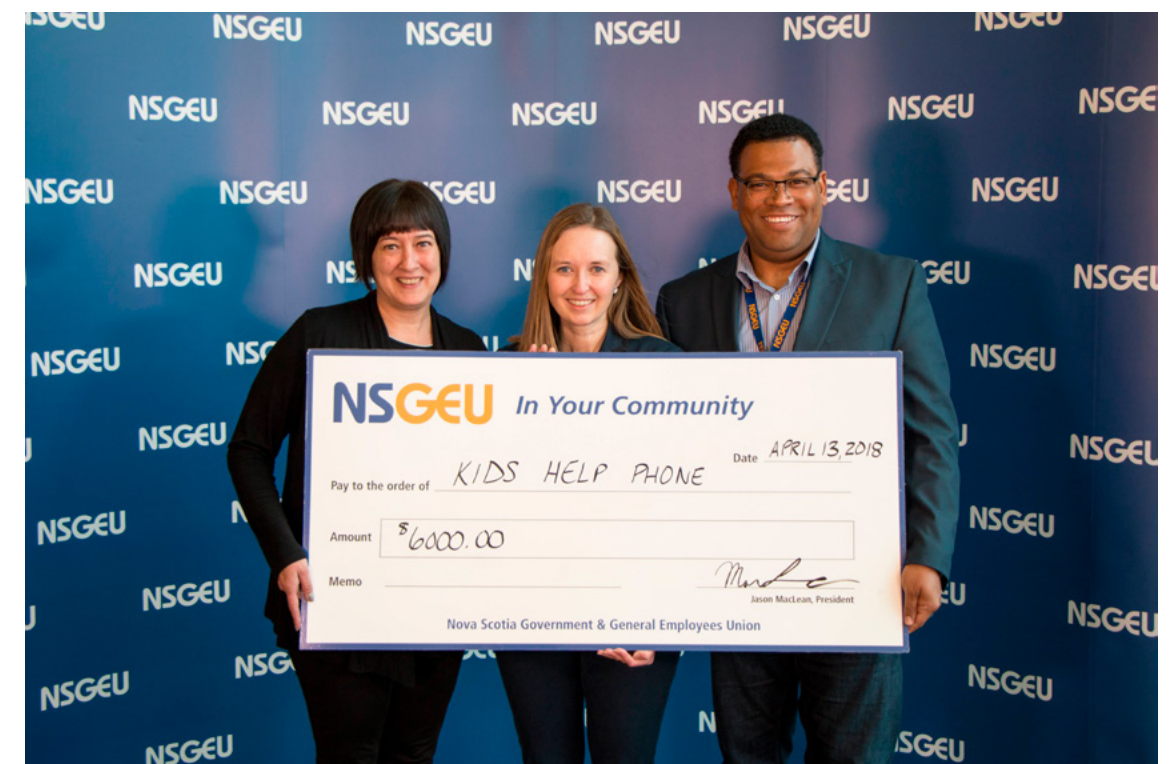
NSGEU donates in support of the Kids Help Phone.