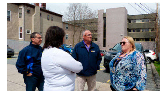
Strike vote information picket.