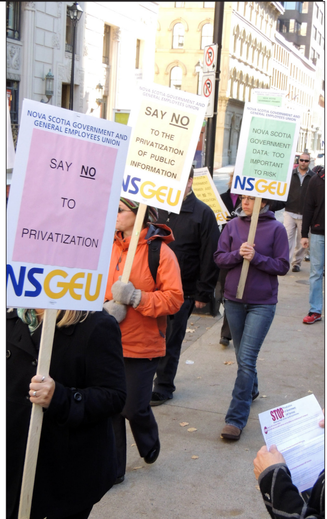
SAP SUPPORT: IT workers and their supporters rallied outside of Province House on October 25.

we were able to negotiate job security provisions with this government. But finding another fit within the Civil Service is a stressful situation for members and their families. The Civil Service is province-wide and a similar job could be located anywhere.