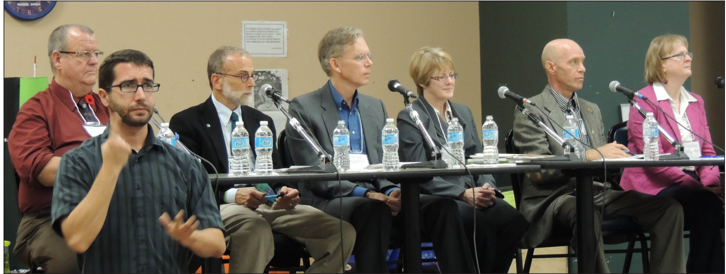
SPEAK UP: Panelists listen during the 5th annual public forum for mental health, which was held in Halifax at the end of October.