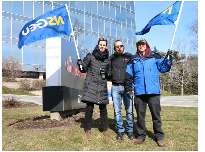
NSGEU members rally to support striking members of the Halifax Typographical Union.