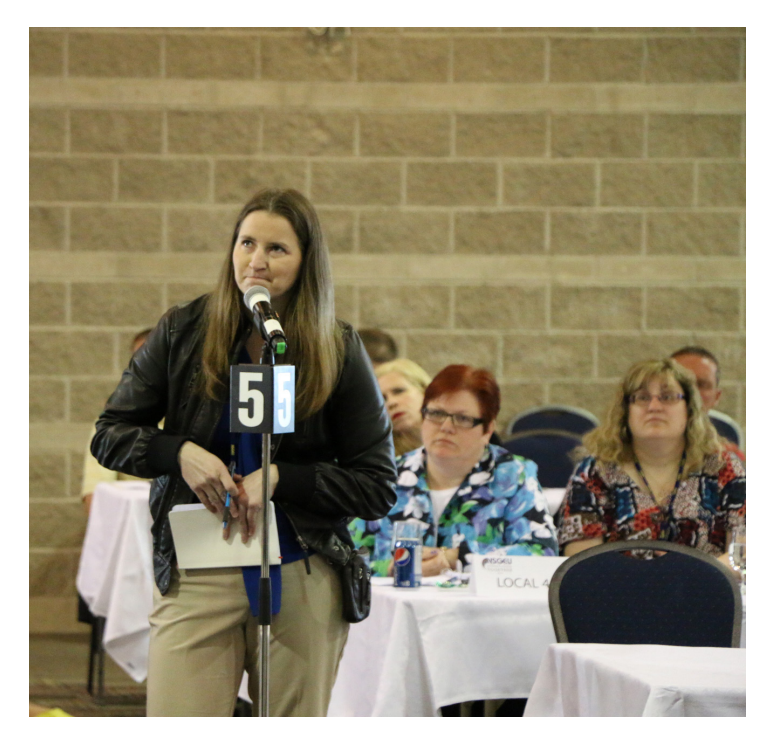
NSGEU members take to the podium during Special Convention.