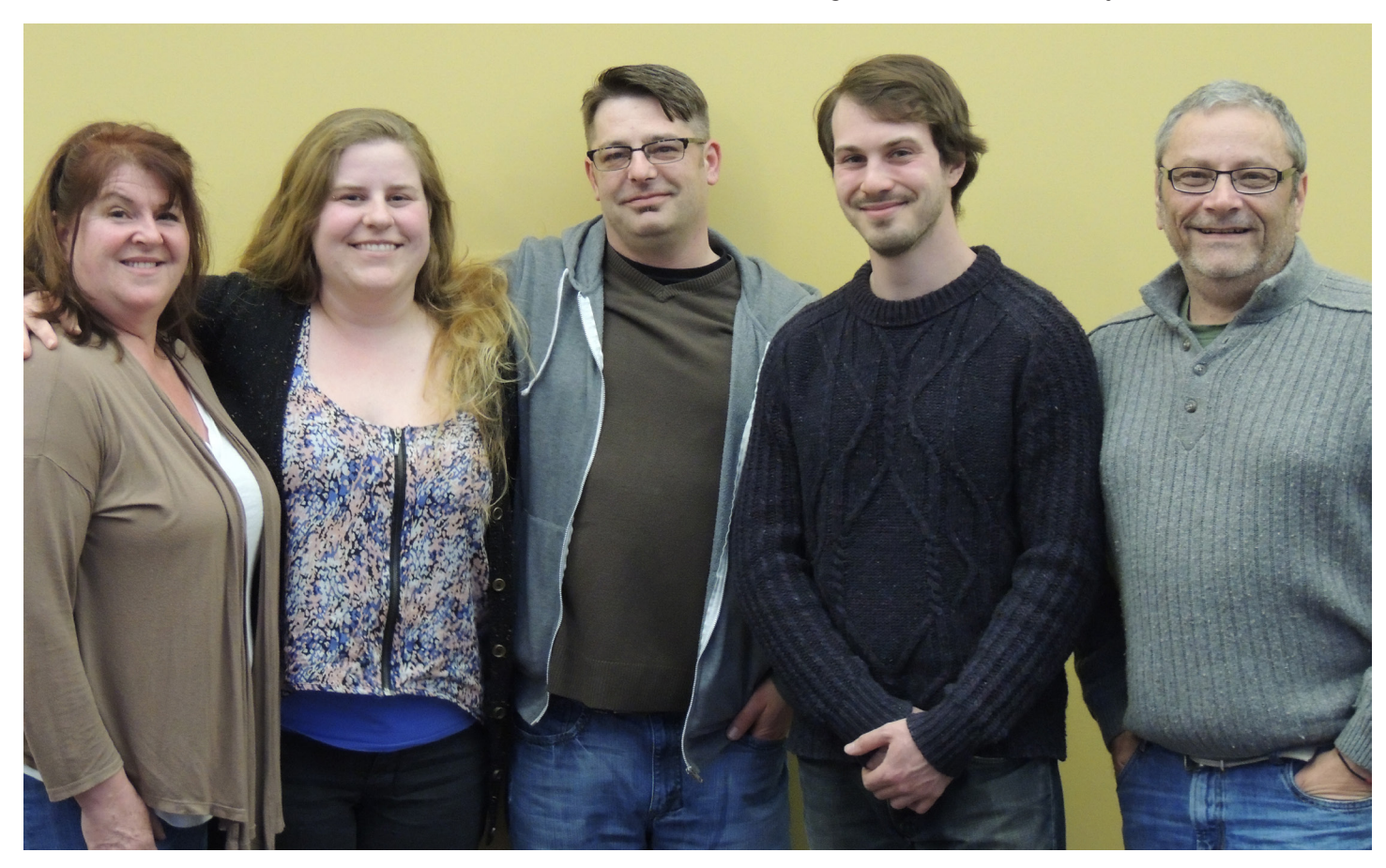
Local 58- Gateway Homes Inc.

We would like to extend a very warm welcome to all of these new members!