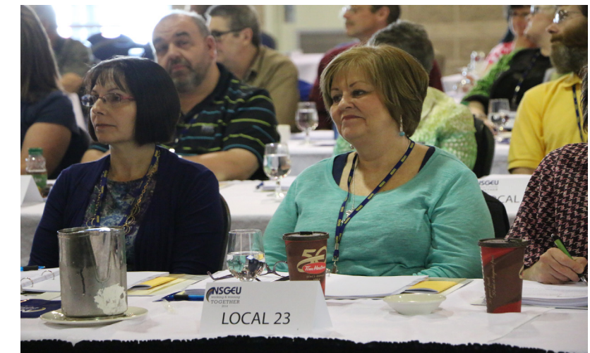
Members listen to speakers at the 2014 Special Convention.

This year's Convention, which will be held from May 11<sup>th</sup> to 14<sup>th</sup> at the Westin Hotel, promises to be the largest we've held to-date, including up to 340 voting delegates! The theme of the 2016 Convention is: "You Are The Union!" and our tagline is a tribute to our outgoing President's favourite saying: "The world is run by those who show up."