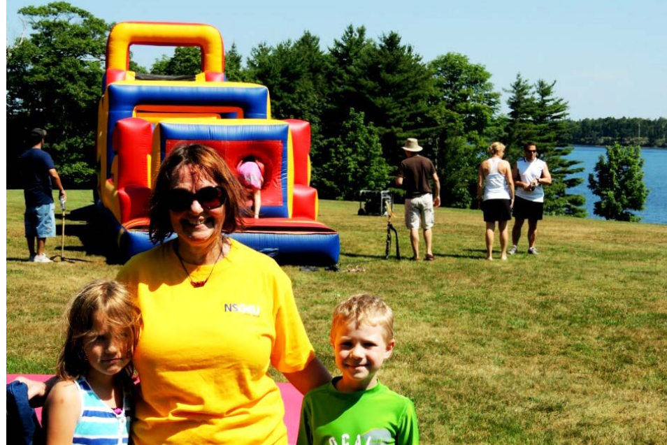
ABOVE: Members, family and friends attended the annual NSGEU Family Picnic at Oakfield Park in August.