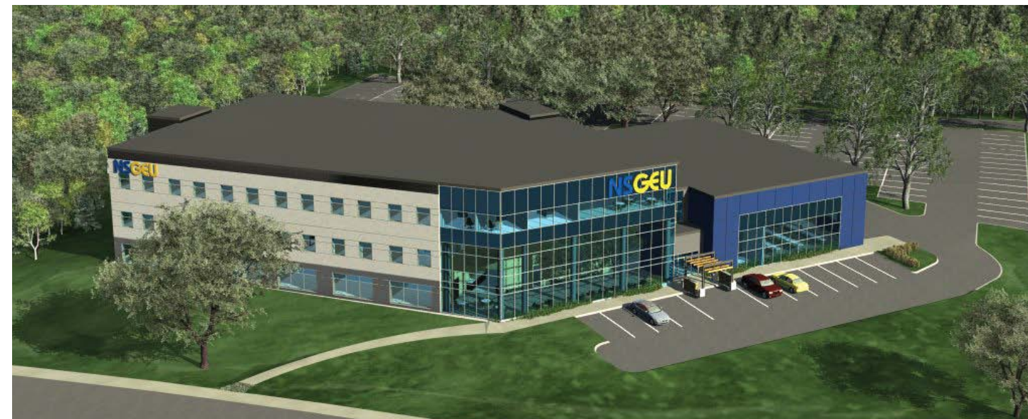
ABOVE: A draft architect’s rendering of the future home of the NSGEU.