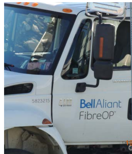
BELOW: Bell Aliant was on-site laying FibreOP lines in late August.