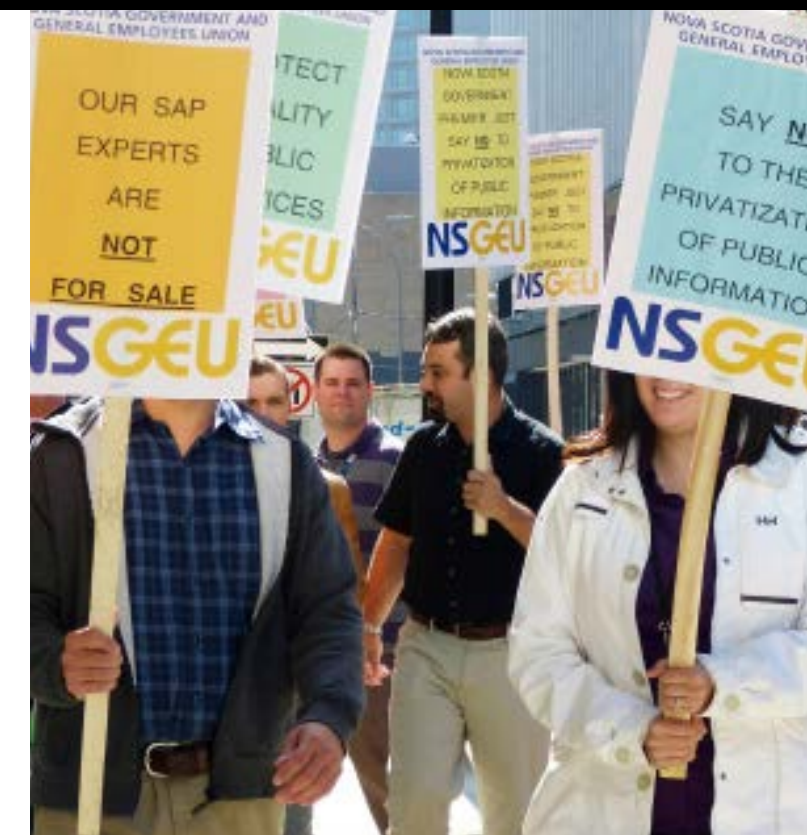
Members and fellow government workers participated in an information picket held in downtown Halifax on October 1st.

Working in the public service, they don't compete against one another for billable hours, they work together to solve