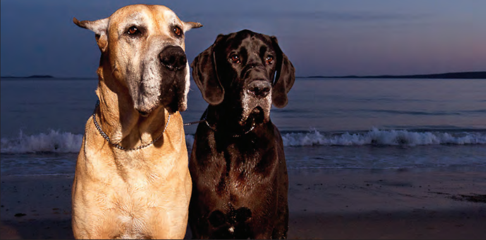
CANINE COMPANIONS: Murphy (left) is a therapy dog, while Austin was training to follow in Murphy's pawprints before he suddenly passed away.