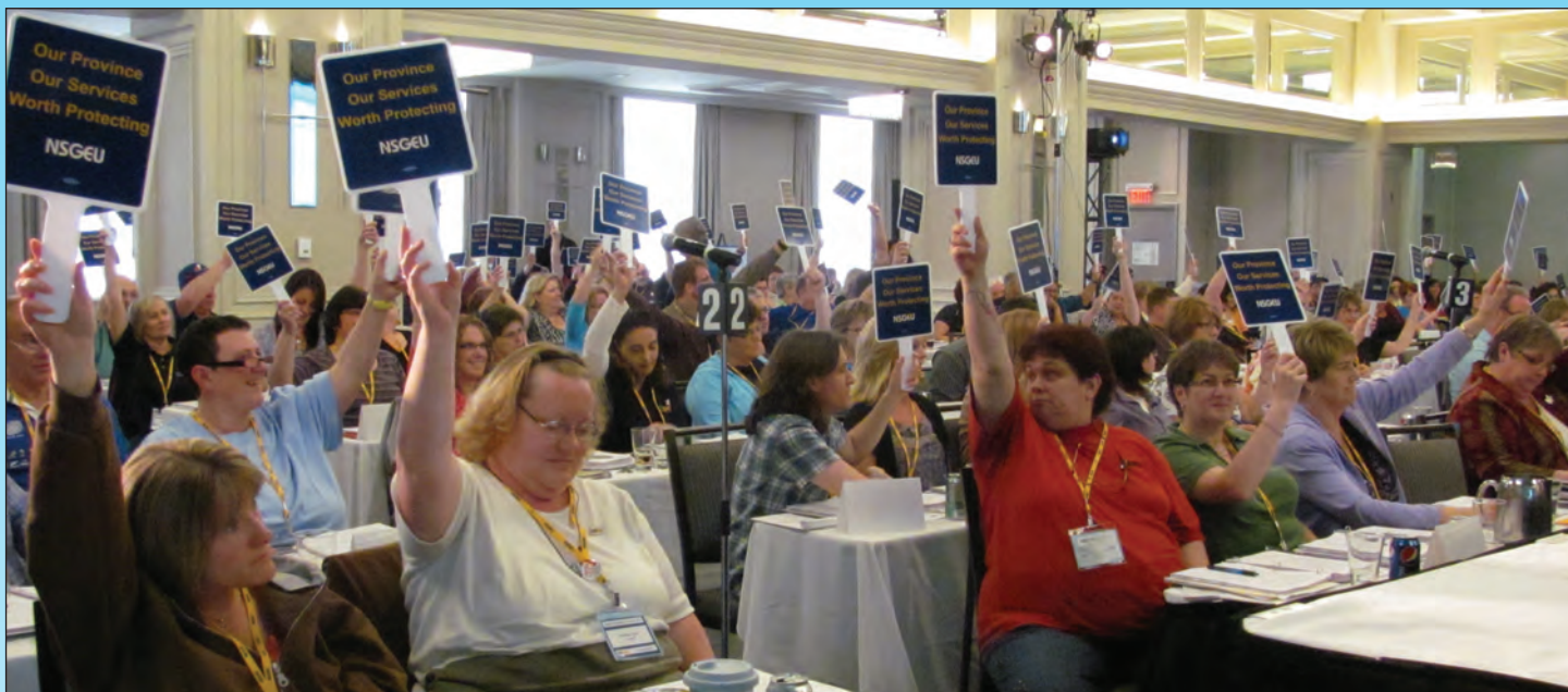
SHOW OF HANDS: Delegates vote in a plenary session during the second day of Convention in 2011.

In your workplace, In your community, Moving forward together!