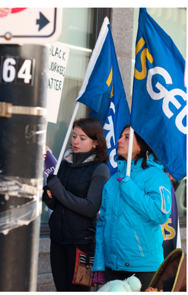
Above/below: NSGEU stands with SEIU as they fought for fairness around racial descrimination at the Justice for Janitors protest