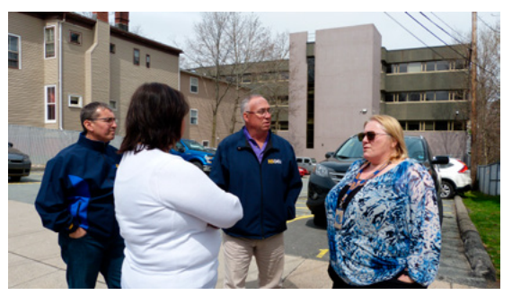
Strike vote information picket.