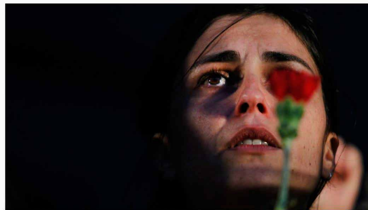
A woman sings a protest song against austerity policies in Portugal. Economics is on her side.