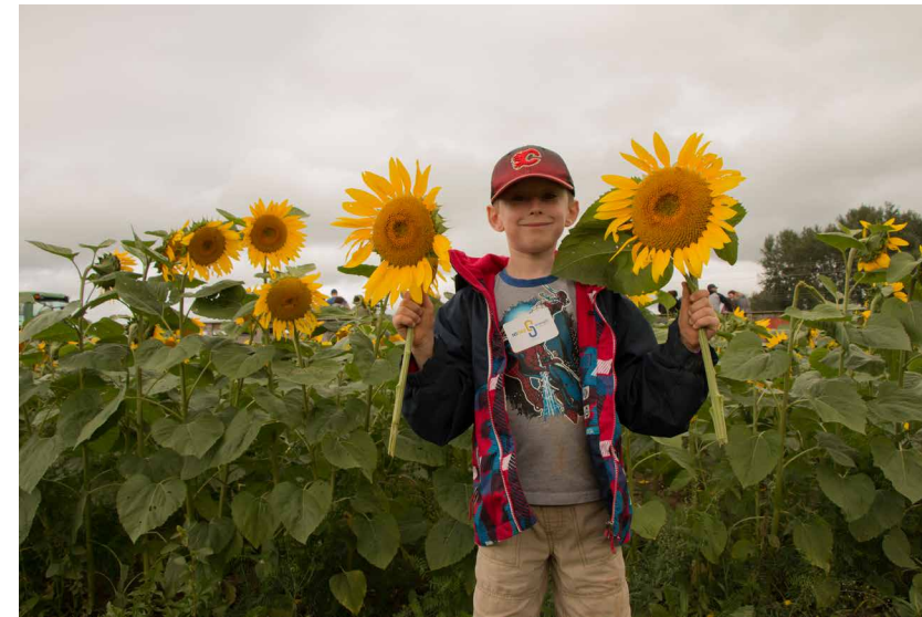
Members and their families took part in the NSGEU Family Fun Day at the River Breeze Corn maze, which included a pumpkin and sunflower u-pick in in Truro, N.S. in September.