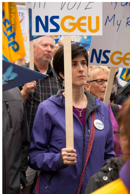
Members protest outside the legislature on September 29.