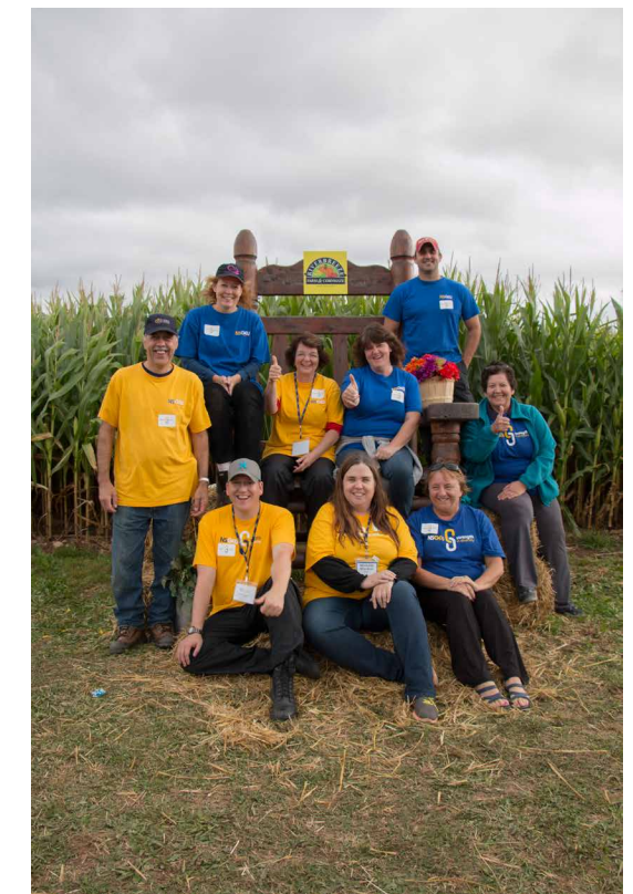
Members of the Cumberland Colchester Regional Council at the NSGEU Family Fun Day.

Member Cumberland/Colchester Regional Council