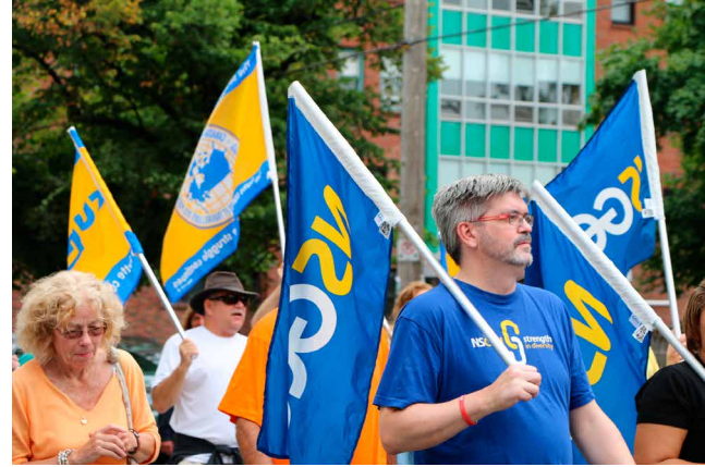
From left to right: Members and their children participated in the annual Labour Day rally on September 1, in Victoria Park, Halifax. NSGEU MLTs pose for photos as part of a joint campaign with the Nova Scotia College of Medical Laboratory Technologists. NSGEU members also took part in the annual Family Fun Day at Riverbreeze Corn Maze in Truro. A sunflower and pumpkin u-pick proved to be a hit with all ages!